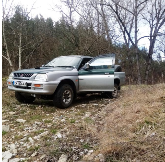
Testing the car in mountain

In the middle of March 2023, as the financing became a fact and we carried out the subsequent actions on final payment (5000 €) for the acquisition of the car and its corresponding registration in the state automobile institution – Vehicle Inspection.